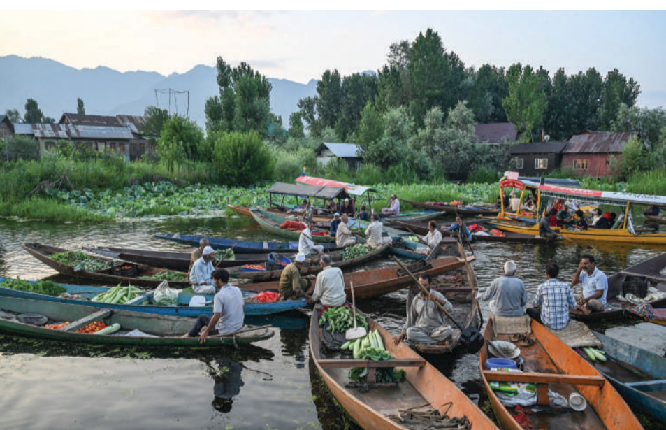
Vegetable-laden shikaras make their way through Kashmir's floating market as vendors sell fresh produce.