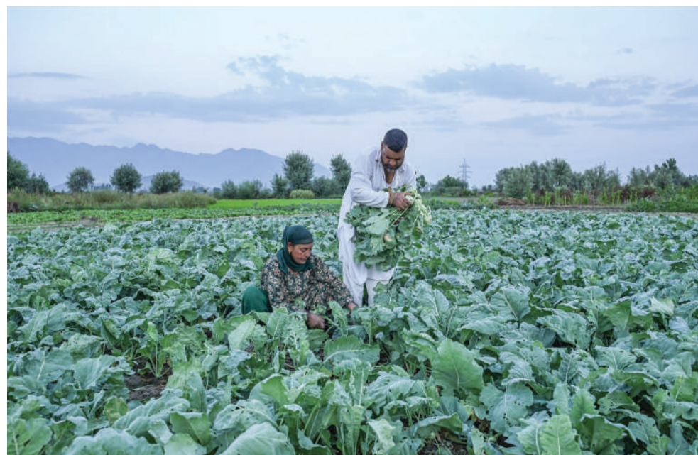
Farmers harvest collard greens, locally known as haakh, in a field in Kashmir. Deeply rooted in the Valley's culinary tradition, the leafy green remains a staple in Kashmiri households.

"The option so exercised shall be final and irrevocable and shall govern all future service matters relating to seniority and promotion of such teacher," | More on P6