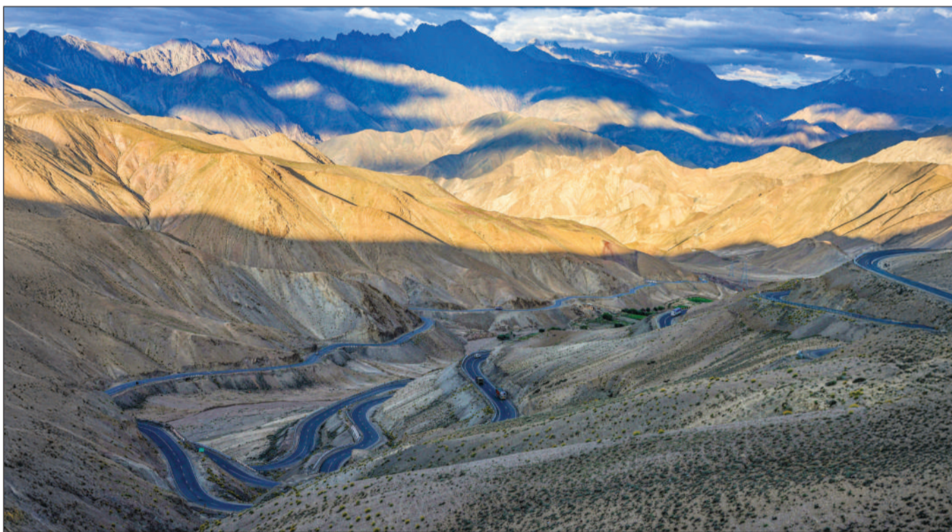
Vehicles make their way along a winding mountain road near Kargil, cutting through Ladakh's stark and rugged terrain.

The weather office predicted light to moderate rain and thundershowers at many places on July 9 and 10, accompanied by brief | More on P6