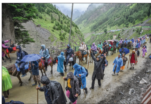
Baltal route in Ganderbal district, even as intermittent rain lashed parts of the region.

The pilgrimage began early in the morning simultaneously via the traditional 48-km Nunwan-Pahalgam route in Anantnag district and the shorter but steeper 14-km