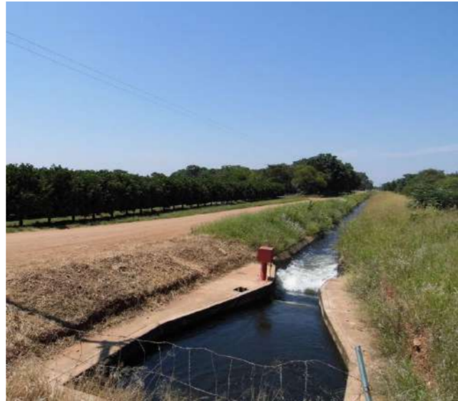
Brahmani (seasonal river in Odisha), Pennar (Andhra Pradesh), Krishna, Mahanadi and Narmada, among others, the authors found.

Overall, the highest human-induced evapotranspiration occurred during the summer in