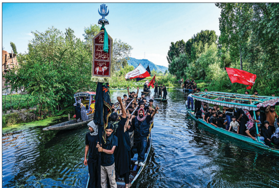
MOURNERS TAKE OUT A TRADITIONAL BOAT procession through the interiors of Dal Lake in Srinagar on the 9th of Muharram.

The Srinagar Traffic Police on Thursday issued