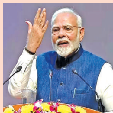
He observed that in cases involving cyber fraud, timely action is crucial to prevent financial loss and re-

The reviews were done by the prime minister at the 52nd meeting of PRAGATI, the ICT-enabled, multi-modal platform aimed at fostering Pro-Active Governance and Timely Implementation by seamlessly integrating efforts of the central and state governments. Reviewing the cases related to cyber crime and digital arrest, Modi noted that citizens should not be made to run from one department or agency to another and emphasised the need for clear ownership, faster response, better coordination among law enforcement agencies, banks and digital platforms, and stronger public awareness campaigns.