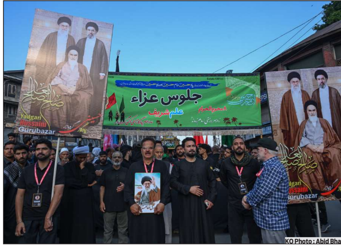
KO

He said public cooperation remained important for the successful conduct of both Muharram observances and the annual pilgrimage.