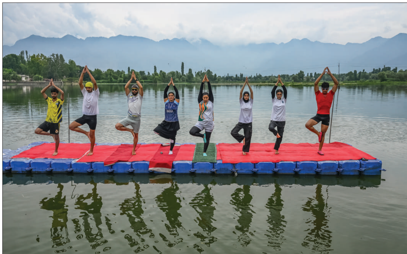
Water sports athletes perform floating yoga on Pokhribal Lake in Srinagar ahead of International Yoga Day.

The notification, issued under the authority of Registrar General M.K. Sharma, stated that the | More on P6