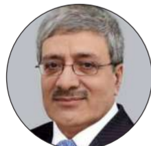
Prof. M. Aslam

As more countries restrict social media access for teenagers, India faces a crucial choice: protect childhood while embracing technology, or continue treating digital exposure as an unavoidable part of growing up.