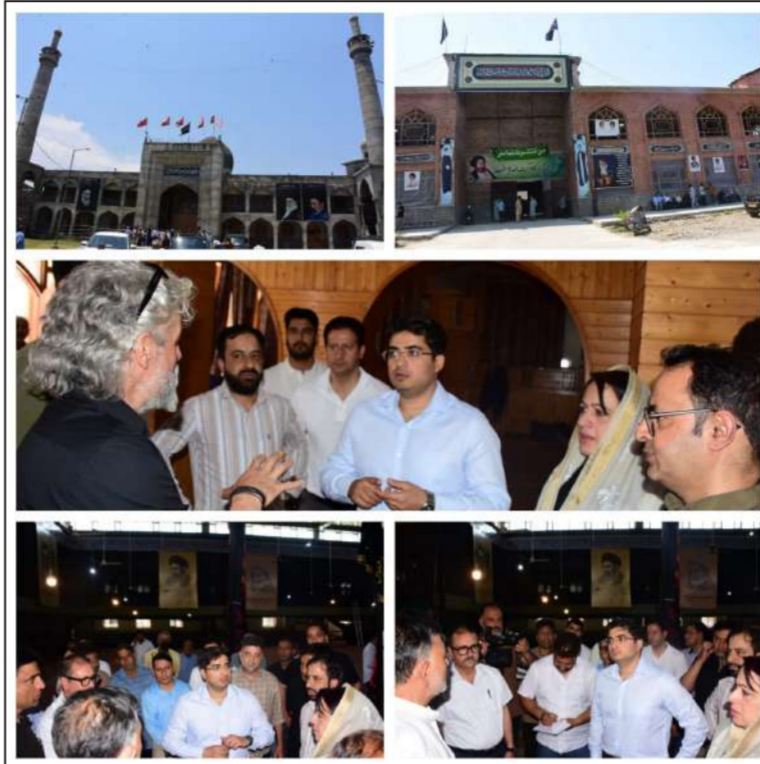
All Civic Amenities must be made available well in advance and directed field officers to maintain continuous monitoring of the arrangements

The Commissioner stressed that all civic amenities must be made available well in advance and directed field officers to maintain continuous monitoring of the arrangements. He emphasized that no deficiency should remain unattended and that all departments must