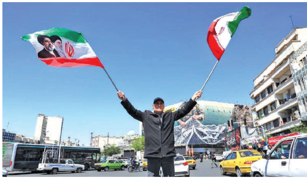
February 28, Trump repeatedly threatened to bomb Iranian infrastructure unless Tehran accepted Washington's terms. Those threats drew widespread condemnation, particularly after US-Israeli strikes reportedly killed more than 160 schoolgirls in the southern city of Minab

dent Donald Trump told Fox News that he may order new strikes on Iran's power plants and bridges, accusing Tehran of delaying a potential agreement with Washington. After weeks of insisting that a peace deal between the United States and Iran was within reach, Trump sharply escalated his rhetoric, suggesting that the window for diplomacy was closing. Speaking to reporters at the White House, Trump warned that the United States would attack Iran "very hard" if a deal was not finalized. "We're going to be attacking them, attacking them very hard," he said. Trump also renewed threats to strike Iran's power plants and bridges despite concerns that attacks on civilian infrastructure could constitute war crimes. During the 40-day U.S.-Israeli war against Iran that began on