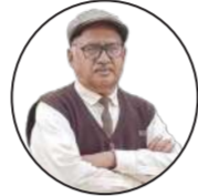
Dr Vijay Garg

Industrial waste heat has long been treated as a byproduct. A breakthrough in hydrogen production suggests it could become one of the clean-energy transition's most valuable assets.