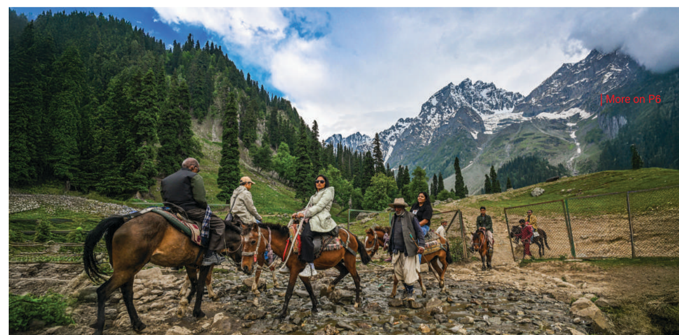
Tourists on horseback traverse the rugged trails of Sonamarg against a backdrop of snow-capped peaks and towering conifers.