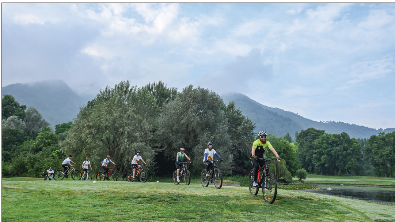
Participants ride through the lush greens of Srinagar during a cyclothon organised by the J&K Sports Council on World Bicycle Day. KO Photo By Abid Bhat

Consequently, the Court dismissed the bail application, clarifying that its observations would not affect | More on P6