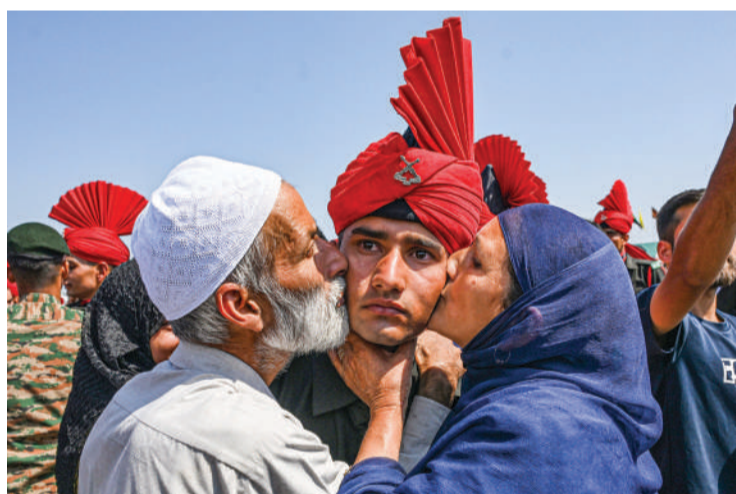
A newly inducted Agniveer is embraced by his parents after the Passing Out Parade at an Army training centre on the outskirts of Srinagar.

dignitaries and family members of the recruits attended the event, adding significance to the occasion.