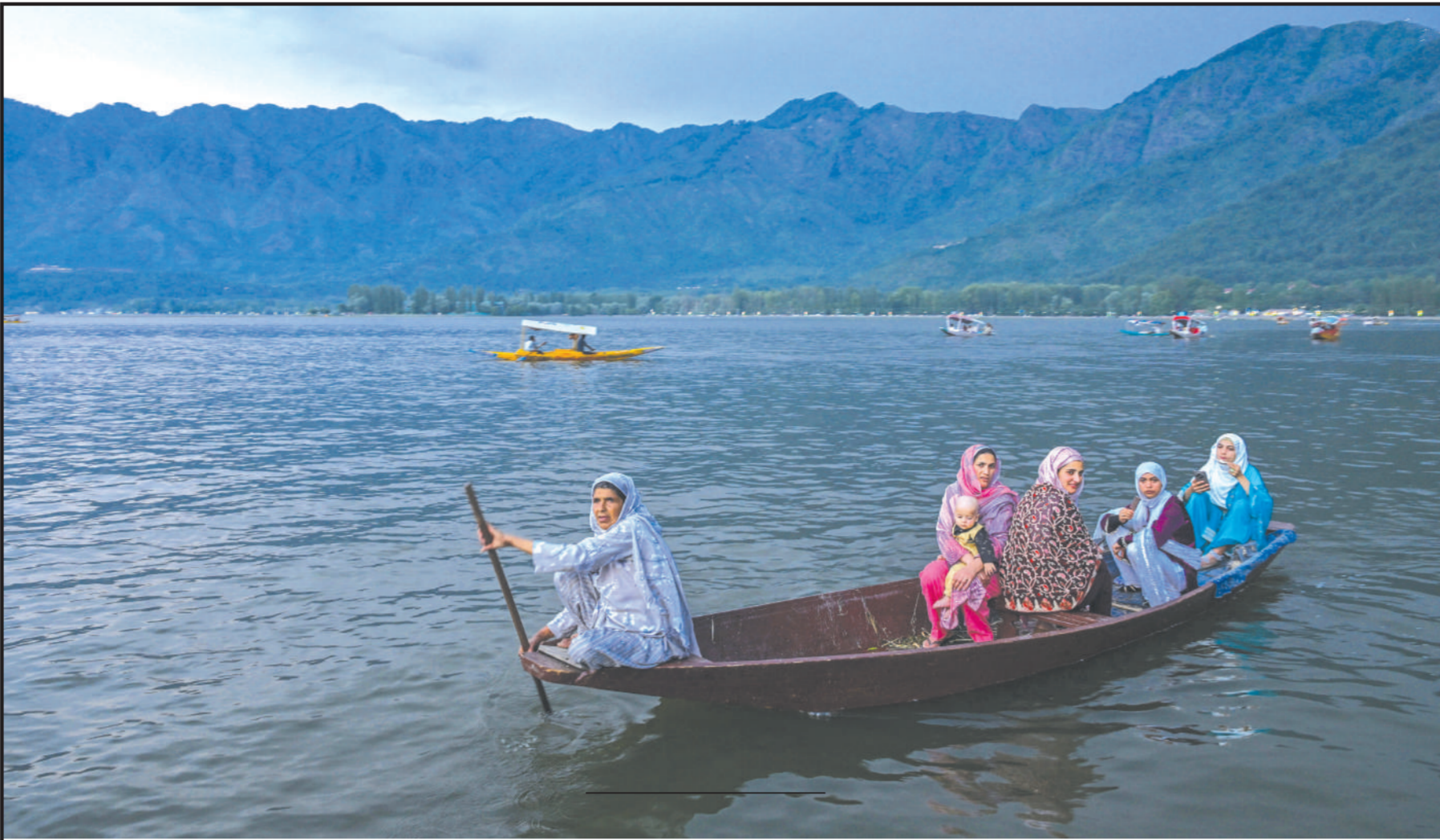
As twilight descends over Dal Lake, women residents of its interior localities travel by boat, a routine journey woven into everyday life.