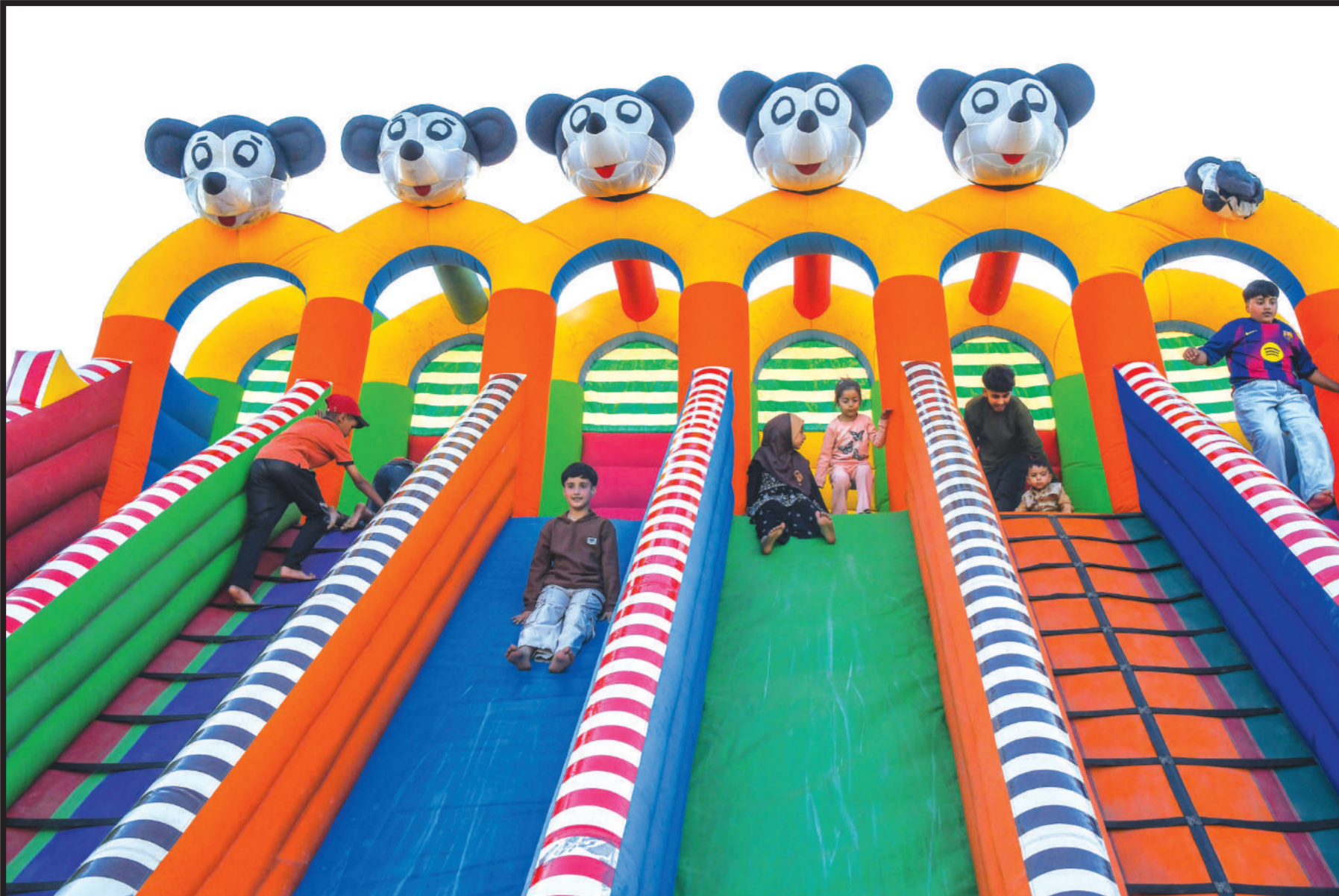
Children enjoy an inflatable slide during Eid-al-Azha celebrations on the third day of Eid on Friday.