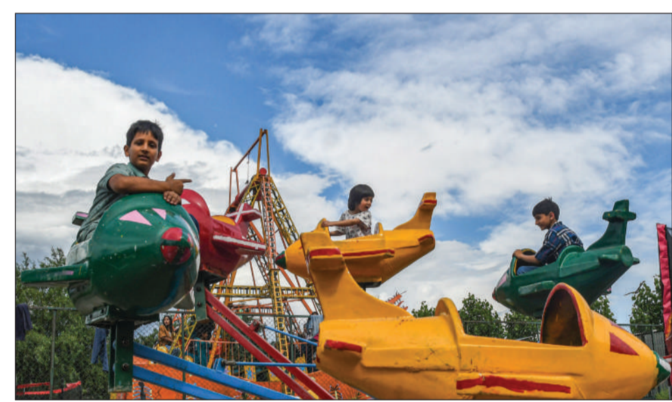
Children enjoy a merry-go-round airplane ride during Eid celebrations in Srinagar on Friday.

Officials said the deployment would be the highest ever for the annual pilgrimage and has been planned in coordination with the Jammu and Kashmir administration and senior | More on P6