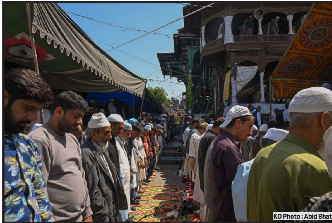
KO Photo : Abid Bhat

The spokesperson added that Khan also called upon traders and business establishments to offer genuine discounts and fair pricing to customers during the festive period.