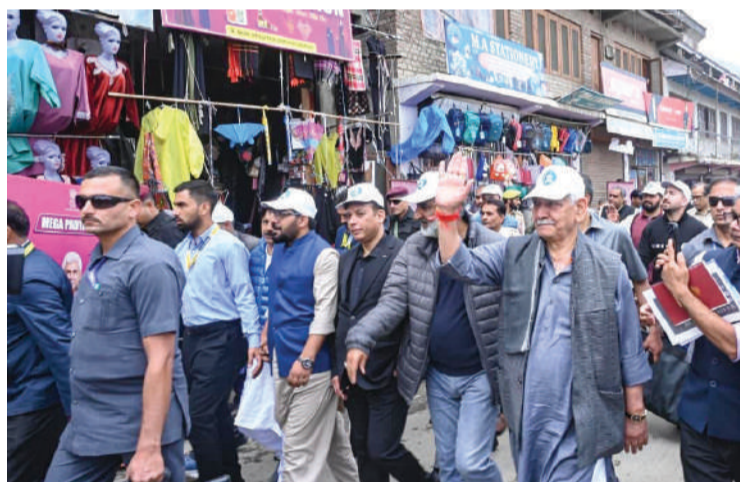
DURING THE PAST 43 DAYS, 797 FIRs had been registered and 894 drug smugglers and peddlers arrested.

millions of people across Jammu and Kashmir were now united with a common resolve to eradicate narcotics-terrorism from the "land of paradise".