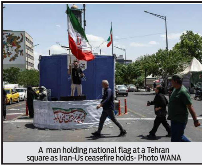
A man holding national flag at a Tehran square as Iran-US ceasefire holds

Recent reports from Iranian and regional media suggest indirect exchanges between Tehran