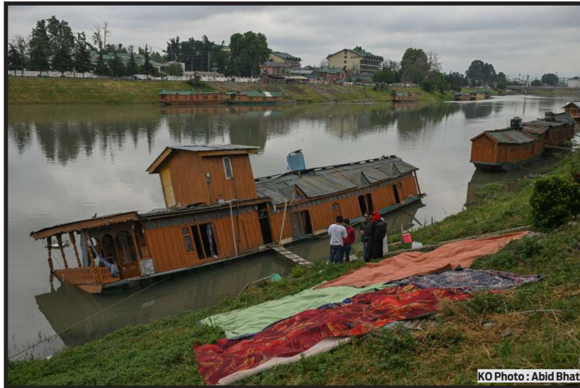
KO Photo : Abid Bhat

"As water levels have risen significantly and fire incidents continue to occur frequently in the city, especially during winters, we decided to conduct a special tabletop exercise focused on these two major vulnerabilities," he said.