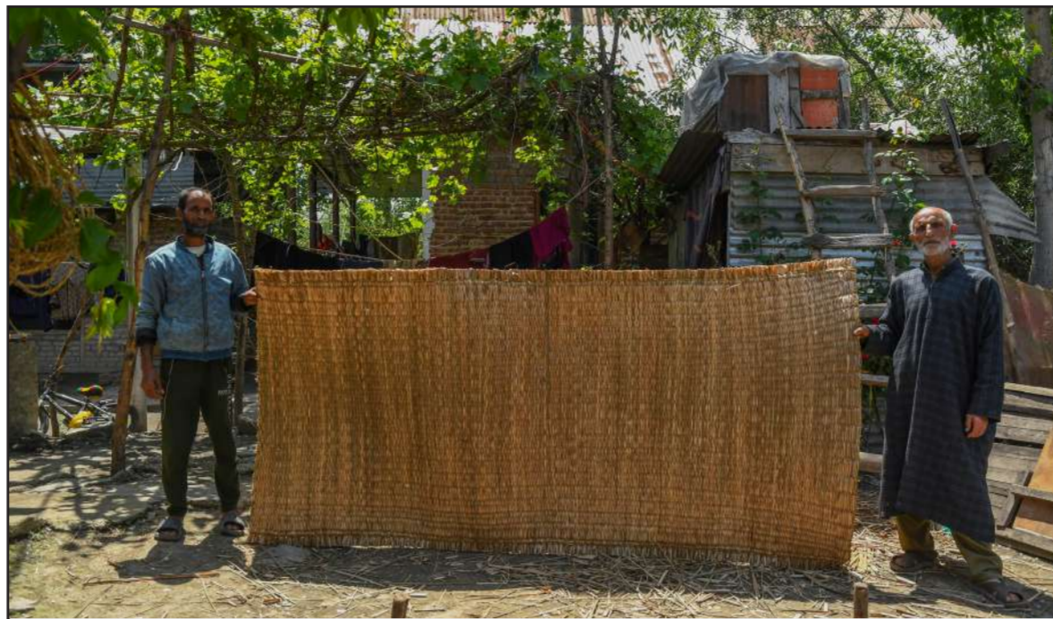
Inside many old Dal Lake homes, Wagu (traditional Kashmiri mat) remains a symbol of warmth and tradition.

Officials further claimed that inquiries had indicated involvement of close associates and family members of the accused in multiple NDPS-related cases across Kashmir, suggesting the existence of a wider narcotics network.