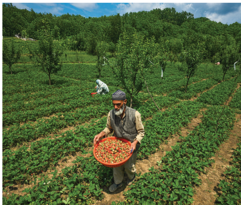
A farmer carries a basket filled with freshly harvested strawberries through a field on the outskirts of Srinagar.

by threatening penalties, legal action or account suspension if payment is not made immediately, a tactic commonly used in phishing and online fraud schemes. Officials | More in P6