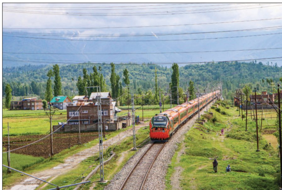
Vande Bharat Express arrives at Srinagar after its maiden run from Jammu. KO Photo By Abid Bhat

The inaugural run from Jammu Tawi Railway Station was jointly flagged off by Railway Minister Ashwini Vaishnav, Union Minister of State Jitendra