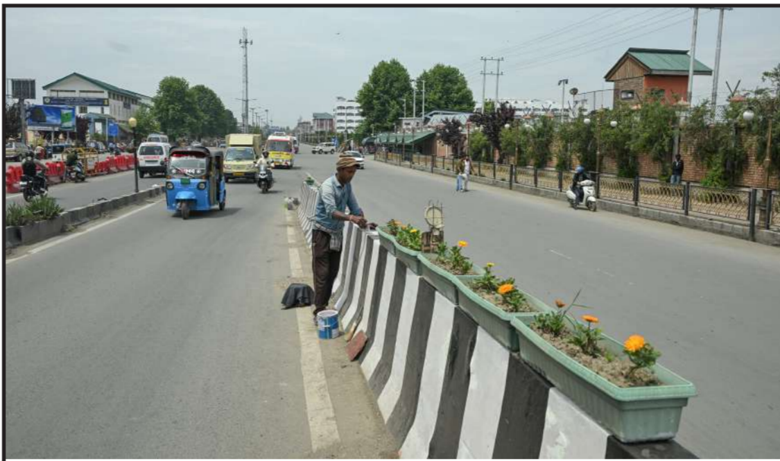
A worker paints road dividers as authorities gear up for the upcoming Darbar Move.

Residents and pedestrians have urged the government to install iron fencing on both sides of the bridge, enhance CCTV surveillance and ensure round-the-clock police deployment in the area.