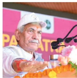
Kashmir Abhiyaan, communities, enforcement agencies and institutions have shown

Addressing the gathering, the Lieutenant Governor said that in just 12 days of the on-going Nasha Mukh Jammu &