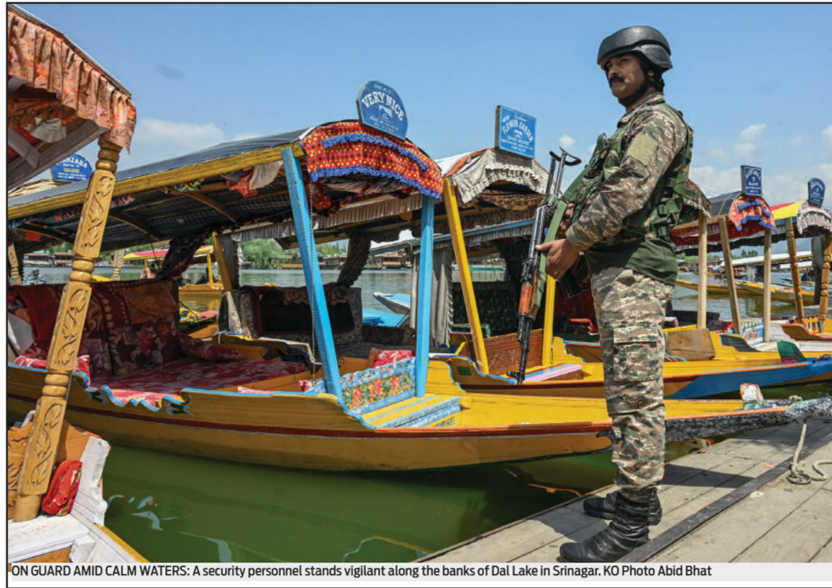
ON GUARD AMID CALM WATERS: A security personnel stands vigilant along the banks of Dal Lake in Srinagar.

The programme concluded with a renewed commitment among students to uphold the values of a drug-free society and to act as ambassadors of positive change within their communities.