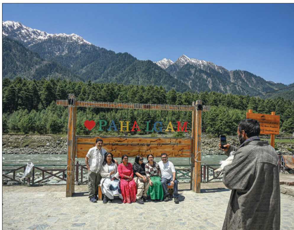
A local man clicks a photograph of tourists at a riverside viewpoint in Pahalgam.

"Preventive detention laws mandate strict adherence to procedural safeguards, including timely communication of grounds, approval by the Government, and reference to the Advisory Board. Any infraction, however minor, vitiates the detention," said a bench of Justice Wasim Sadiq Nargal while setting aside the detention order dated 19 April 2024 issued by the | More on P6