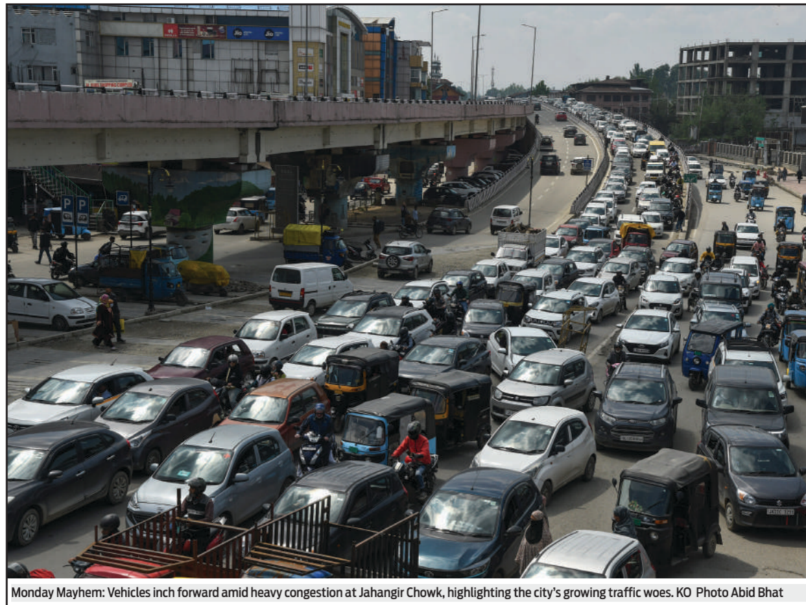
Monday Mayhem: Vehicles inch forward amid heavy congestion at Jahangir Chowk, highlighting the city's growing traffic woes.

The Amandeep Group has grown into a prominent healthcare network, comprising over 750 beds and a distinguished team of more than 170 specialist doctors across six strategic locations.