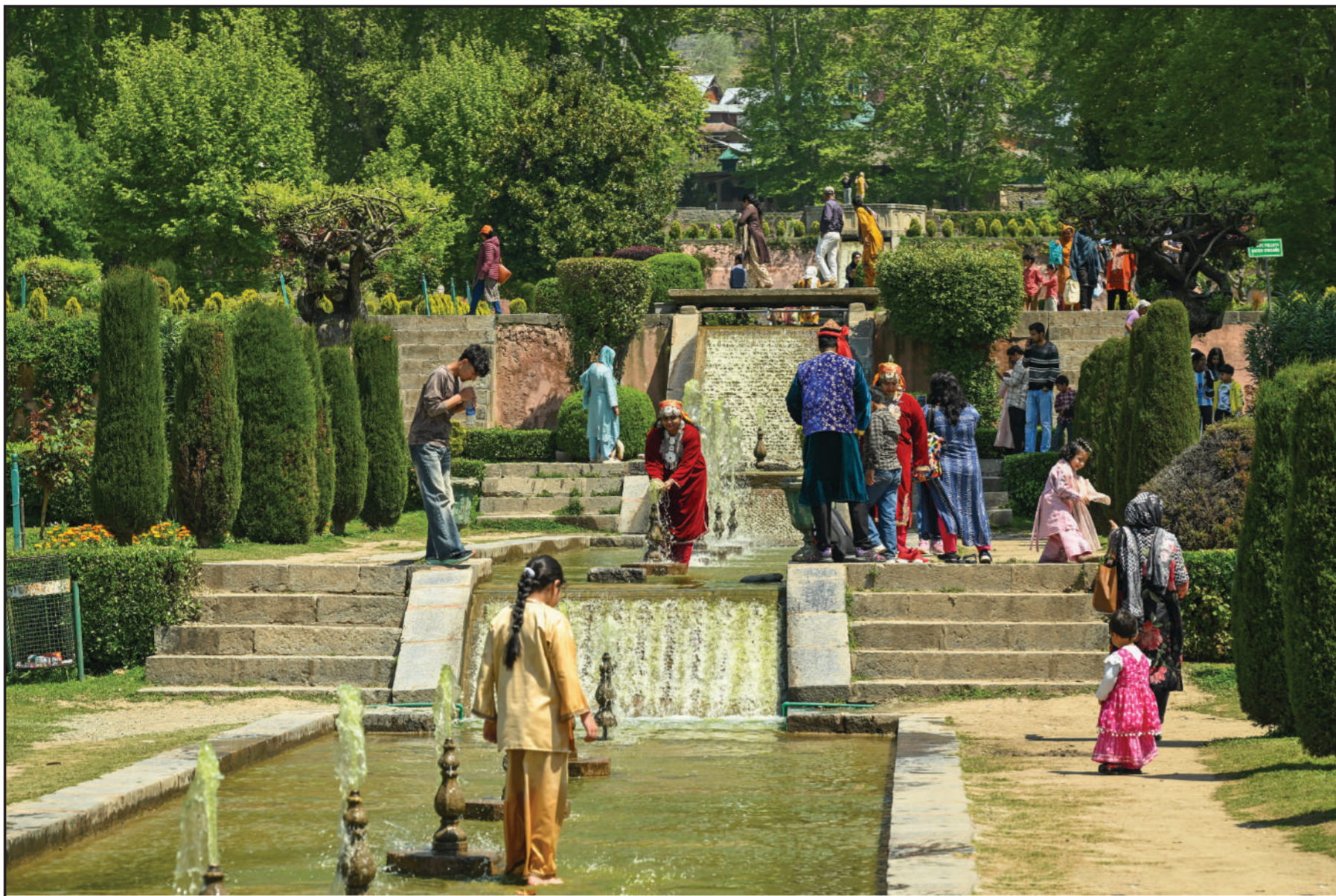
Visitors throng Nishat Bagh enjoying a sunny day amid blooming gardens and cascading fountains.