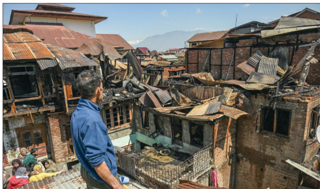
Residents stand amid the charred remains of homes after a massive fire gutted seven houses in Chandpora, Nowhatta, Srinagar, on Tuesday.

Meanwhile, Union Home Minister Amit Shah also paid tributes | More on P6