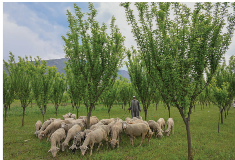
A shepherd tends to his flock in an orchard in Pampore.

Highlighting major achievements, the officials said the boundary demarcation of the lake has been completed by installing | More on P6