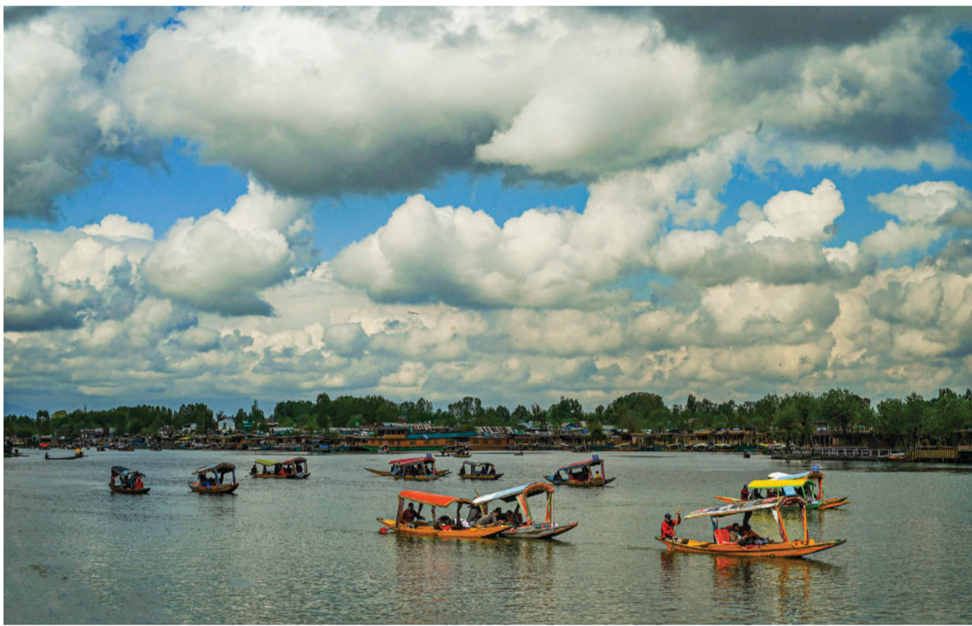
Shikaras move across Dal lake in Srinagar under heavy cloud cover after days of continuous rainfall across the Valley.

The Lieutenant Governor called for mass public participation to make the campaign effective, urging students, youth, NCC, NSS, Scouts and Guides, volunteers, civil society organisations, political parties and the general public to join the movement. "The influx of drugs to the UT is part of a larger international conspiracy to jeopardise the future of the youth of Jammu and Kashmir. Every section of society must join this fight against