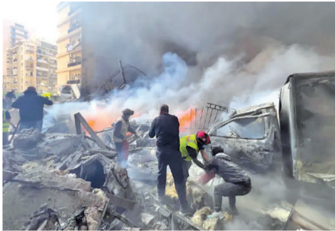
A deadly midday barrage

ducting 100 raids within 10 minutes in Beirut, southern Lebanon and the eastern Bekaa Valley. Black smoke towered over several parts of the seaside capital, where a huge number of people displaced by war have taken shelter. Explosions interrupted the honking of traffic on what had been a bustling, blue-sky afternoon. Ambulances raced toward open flames. Apartment buildings were struck. AP journalists saw charred bodies in vehicles and on the ground at one of Beirut's busiest intersections in the central Corniche al Mazraa neighbourhood, a mixed commercial and residential area. Using forklifts, rescue workers removed smouldering debris and sifted through ruins for survivors. In response to the attacks on Lebanon, Iran later Wednesday said it will once again halt the movement of oil tankers in the Strait of Hormuz, the country's state-run media reported.