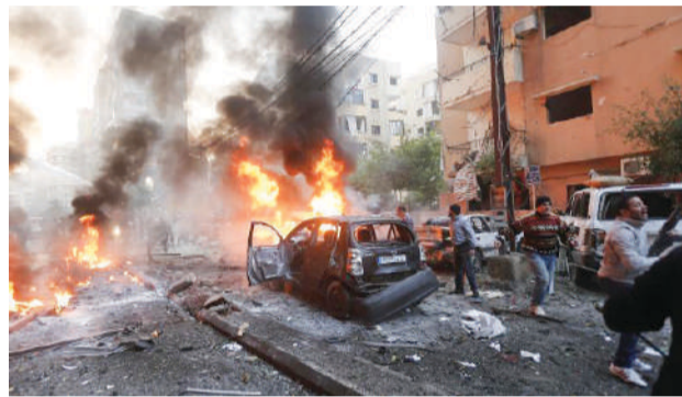
Israeli strikes hit several areas in Beirut without warning on Wednesday.

A senior Iranian security official said the world was witnessing Israel destabilise what was already a tenuous agreement. "The entire world is currently witnessing the