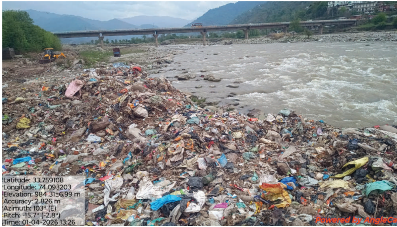
Latitude: 33.759108 Longitude: 74.093203 Elevation: 984.31±6.99 m Accuracy: 2.826 m Azimuth: 103° (E) Pitch: -15.7° (-2.8°) Time: 01-04-2026 13:26 Powered by AngieCam

I submitted photographs to the court showing heavy machinery pushing refuse directly into the river during rainfall, burying some under soil, washing the rest