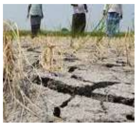
ability becomes limited.

He added that farmers can consider these alternatives if dry weather conditions continue and irrigation avail-