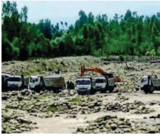
Tribunal (NGT), has submitted its report to the Tribunal through the J&K Pollution Control Committee (JKPCC).

The seven-member panel, formed by the Deputy Commissioner of Budgam in August last year following a directive from the National Green