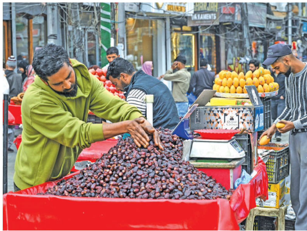
A VENDOR ARRANGES PILES OF DATES at a roadside cart on the 17th day of Ramadan, as people shop for Iftar essentials.