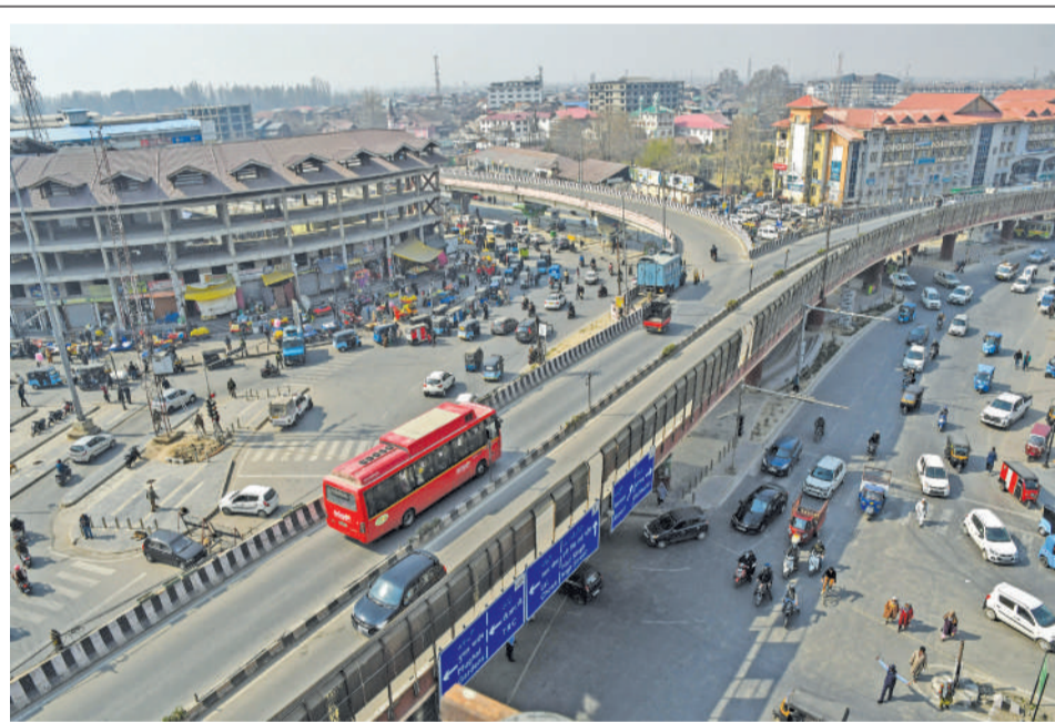
MOVEMENT OF TRAFFIC at Jehangir Chowk signals a return to normalcy in Srinagar on Thursday.

"Insofar as Shop No. 5 is concerned, the technical report indicates that it shall be fit for occupation only upon removal of the existing wooden plank roof and laying of an RCC slab," the court said and directed landlords to carry out the rectification expeditiously, strictly in accordance with the technical recommendations contained in the report.