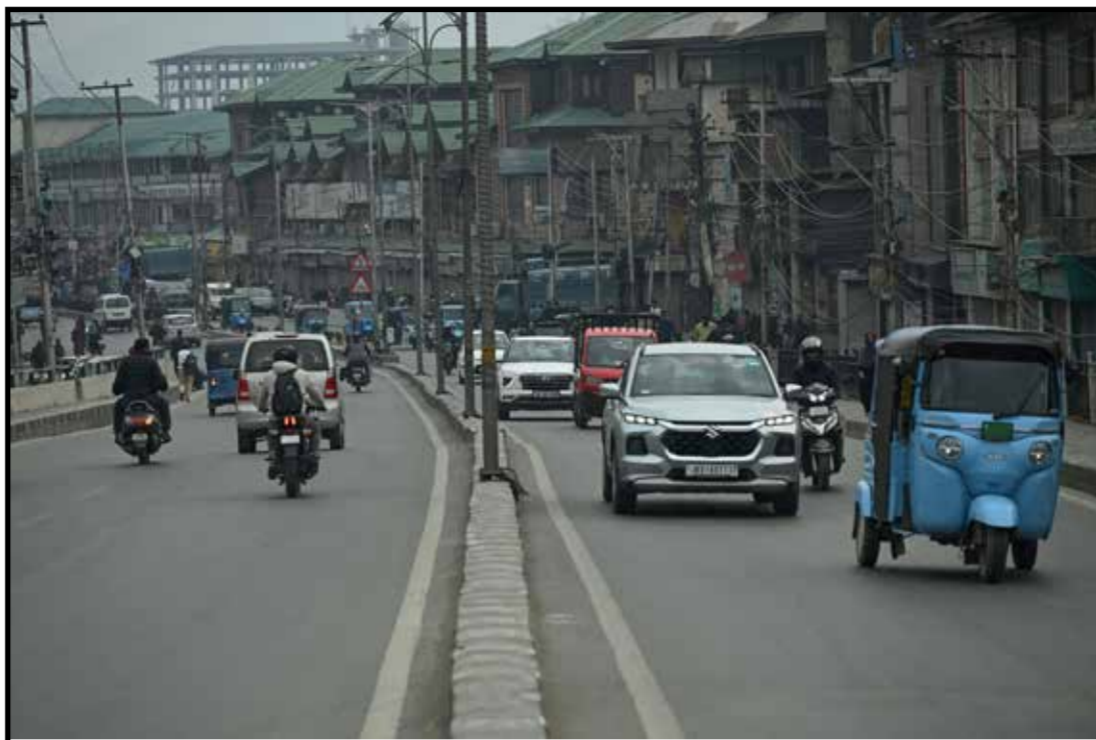
Vehicles ply on M. A Road as movement eased in parts Srinagar on Wednesday.

According to KNT, Police have urged citizens to remain vigilant online and use available tools to safeguard their privacy.