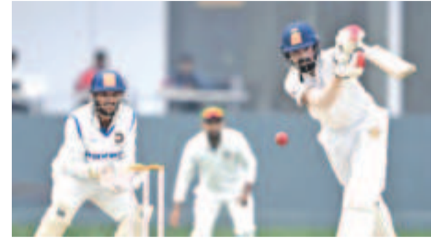
for six mid-way through the second session.

Karnataka were pressing for an outright win after reducing Uttarakhand to 156