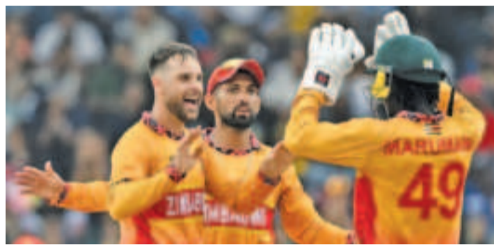
a return catch.

In all, they added 69 runs for the first wicket in 8.3 overs before Marumani fell to Dunith Wellalage, offering the left-arm spinner