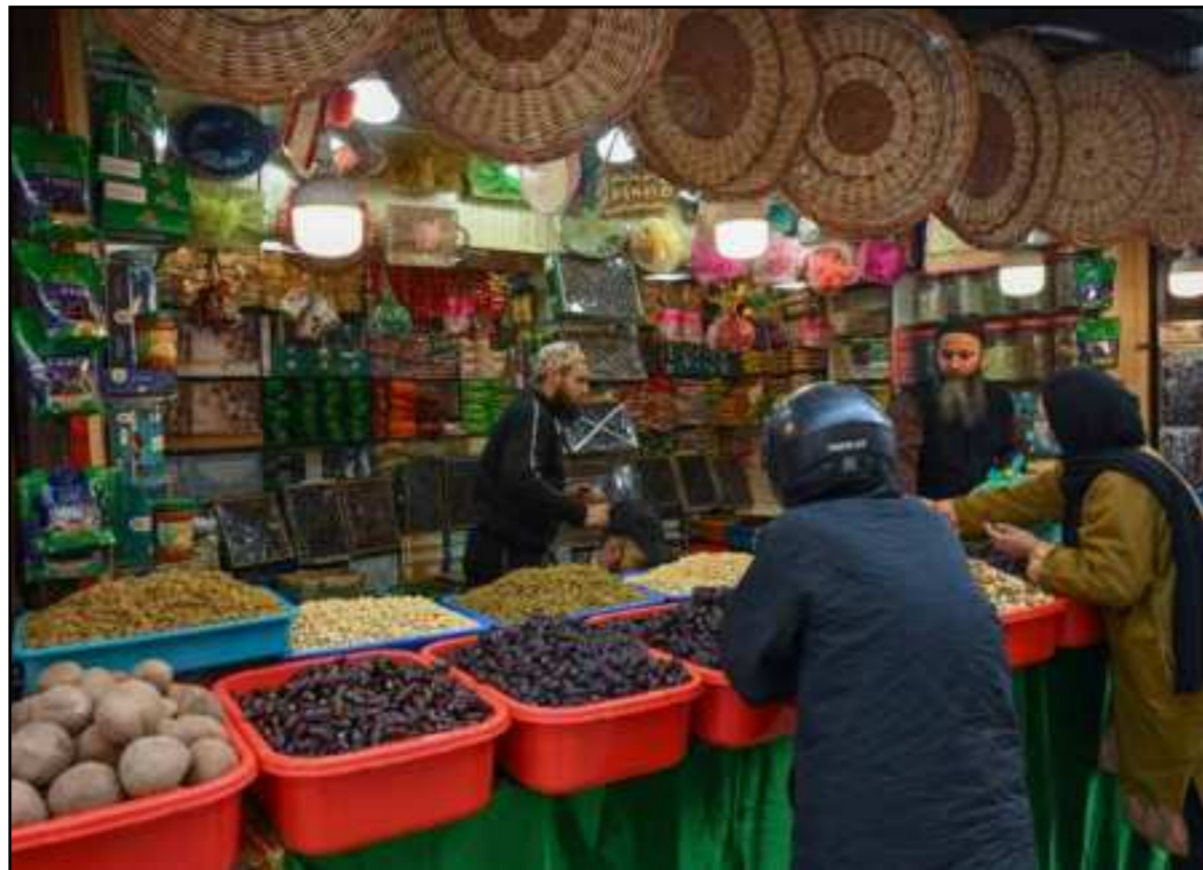
Ramazan shoppers buy dates at a bustling market stall in Srinagar.

At the premier tertiary care facility, Sher-i-Kashmir Institute of Medical Sciences (SKIMS), the minister said that highly qualified specialists, including those with MD/MS and DM/MCh qualifications, remain available during night hours in emergency services as well as inpatient wards.