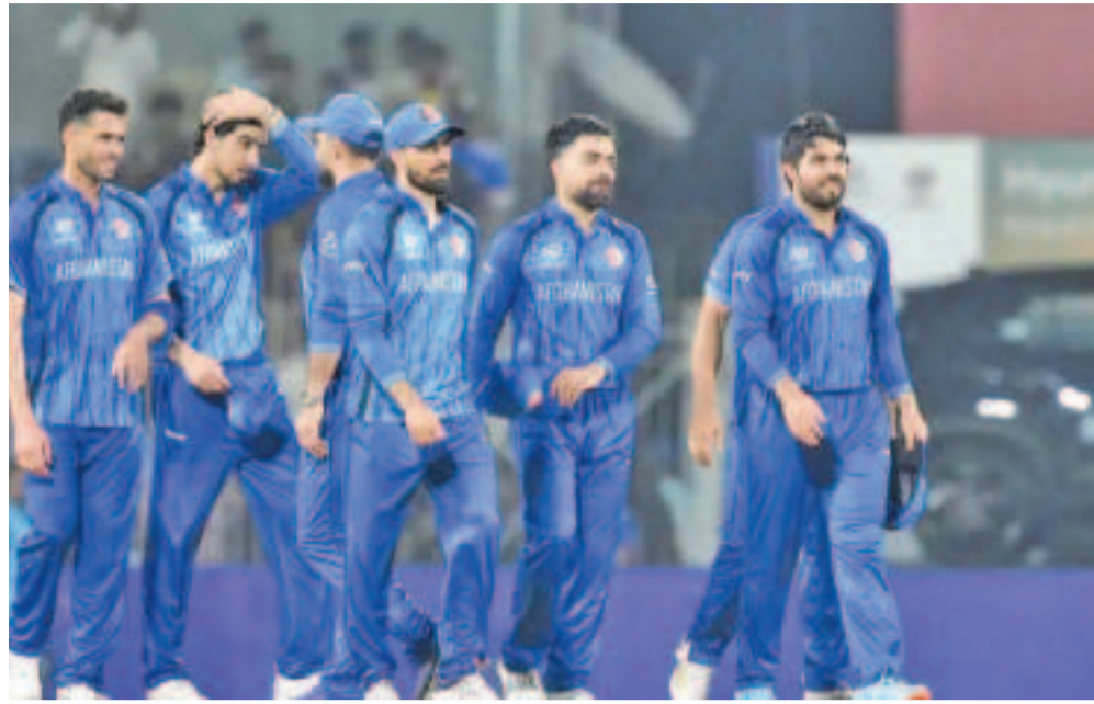
With wickets falling at regular intervals and the required run rate soaring, Canada folded

Nabi returned remarkable figures of 4 for 7 in four overs, while skipper Rashid Khan chipped in with two wickets.