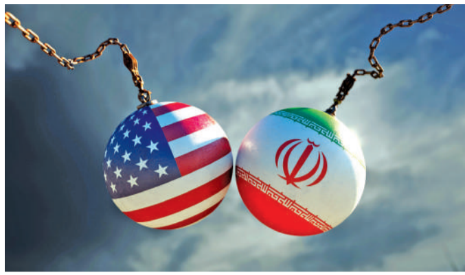
a 12-day war. The latest round was initially planned for Istanbul but was relocated to Muscat at Iran's request. Tehran has repeatedly emphasised that any engage-

The format is expected to mirror the structure of negotiations held last year, before talks were derailed by a sudden escalation in hostilities. A sixth round had been planned at the time but was cancelled after Israel launched a large-scale military campaign against Iran, later joined by US forces, resulting in