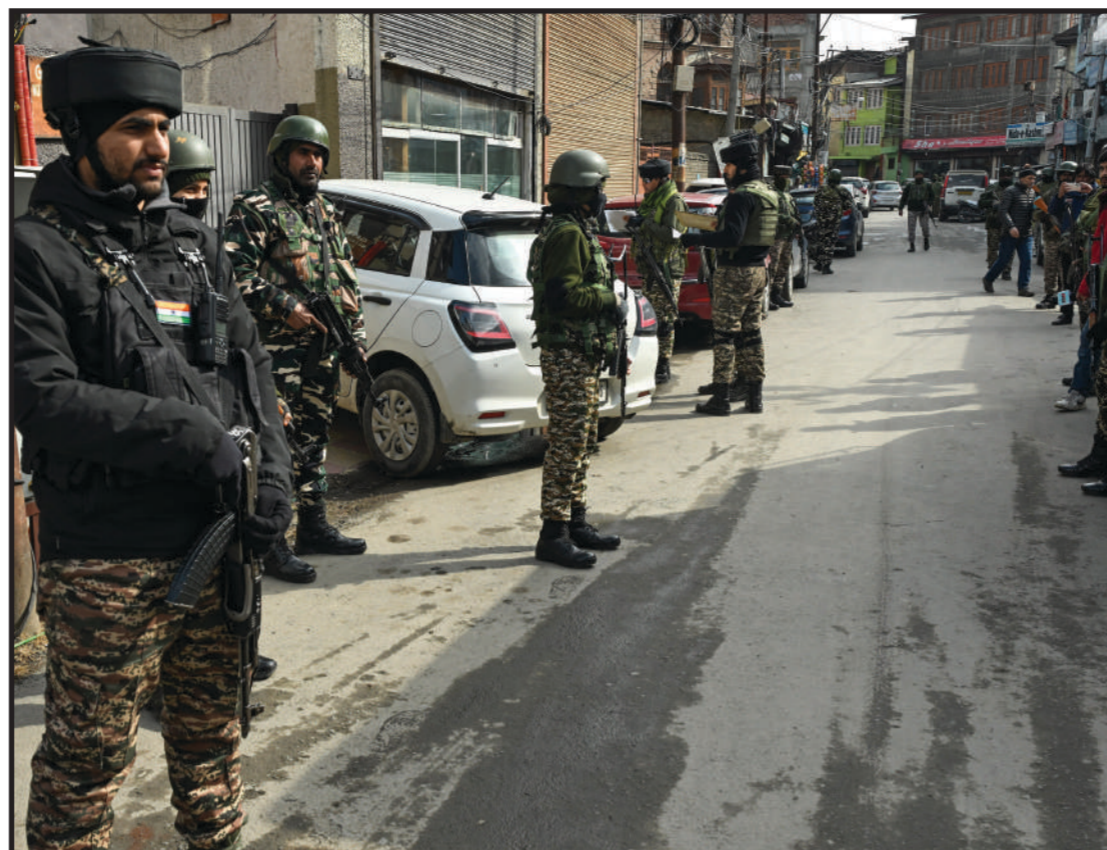
Security forces carry out search operations ahead of Union Home Minister Amit Shah's visit to Jammu and Kashmir.

According to KNT, authorities said no loss of life or injuries were reported in the incident. The exact cause of the fire is yet to be ascertained and an investigation has been initiated.