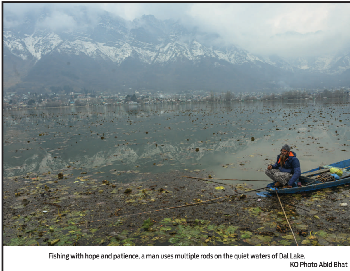
Fishing with hope and patience, a man uses multiple rods on the quiet waters of Dal Lake.

While directing for joint inspection of agencies for assessing site interventions, he emphasized that a consolidated report outlining all required interventions be compiled and submitted within one week.