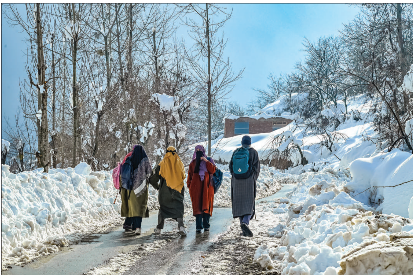
A quiet winter walk through snow bound Khan Sahab, Budgam, where life moves forward, step by step.

Officials said the gunfight began when troops involved in the joint operation under Operation Trashi I made contact with the terrorists in the early hours of the day. The operation is being carried out by the army's White Knight Corps along with Jammu and Kashmir Police and CRPF. "A cordon has been established and operations are in progress," the army said, adding that intelligence inputs from multiple agencies were coordinated to plan and execute the operation on the ground. According to | More on P6