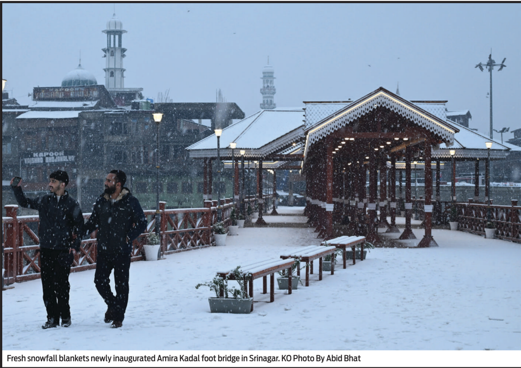
Fresh snowfall blankets newly inaugurated Amira Kadal foot bridge in Srinagar.