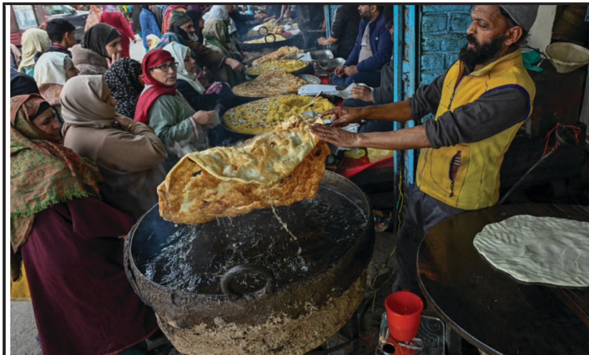
Hazratbal buzzes with devotees as traditional snacks are prepared on the eve of Shab-e-Meraj.