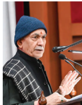
of Youth Services and Sports at Jammu. The conference aims to identify actionable strategies to

The Lieutenant Governor was speaking at the inauguration of the two-day National Level Sports Conference - SRIJAN, organised by the Department