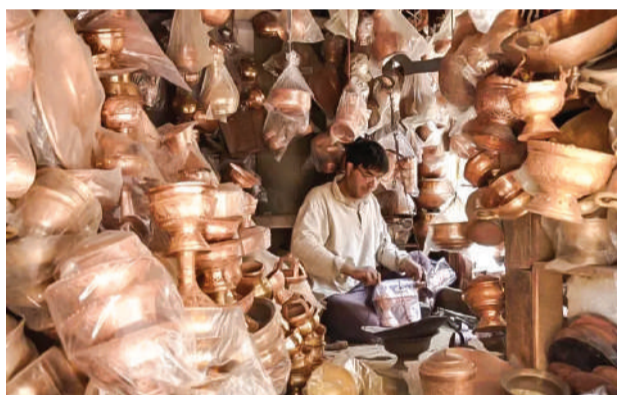
By early 2026, the value of Masoodi's copper exposure had grown to about 3.4 lakh, giving him a profit of

That long climb reflected a return of more than 700 per cent over two decades and convinced him that copper had entered a new phase.