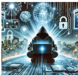
The fraudsters also projected themselves as officials from the Telecom | More on P6

In a statement, the Crime Branch J&K said that the couple was approached by the fraudsters through WhatsApp video call informing them that the callers belong to CBI and are investigating the couple for their alleged involvement in a big financial fraud.