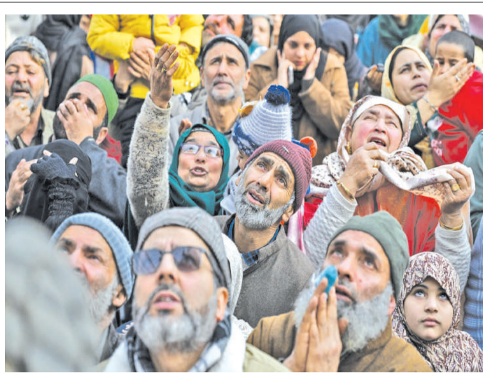
EMOTIONAL SCENES at the Hazratbal Shrine as devotees pray during the display of the Holy Relic on Shab-e-Meraj.

The Association welcomed the safe return of the students, saying it has brought much-needed relief to anxious families across Jammu and Kashmir, while noting that many more students studying in different parts of Iran are expected to return in the coming days through commercial flights. (KNO)