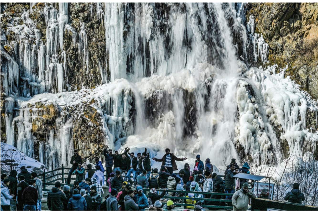
Tourists gather at the frozen Drung Waterfall in Tangmarg as sub-zero temperatures transform the cascading waters into towering sheets of ice.