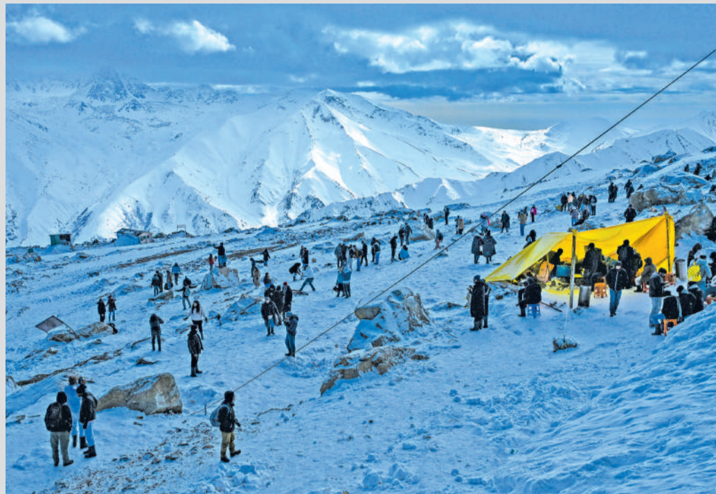
and described the snowfall as a blessing. Another tourist termed the celebrations peaceful and memorable, saying the atmosphere exceeded expectations. Authorities had put in place

Tourists expressed satisfaction over the overall experience. A visitor from Haryana said they had been in the Valley for three days to celebrate the New Year