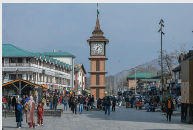
with moderate snowfall expected over a few higher reaches of north and central Kashmir.

Srinagar: Contrary to the weather forecast issued by the Meteorological Centre Srinagar, the city did not witness any snowfall or rainfall on December 31, with Srinagar and its adjoining areas remaining dry throughout the day. Earlier, the Meteorological Centre Srinagar had, through a post on its official X handle @metsrinagar, forecast the possibility of light rain or snowfall at many places across Jammu and Kashmir from the evening of December 30. The forecast further predicted light rain or snow at most places during December 31 and January 1,