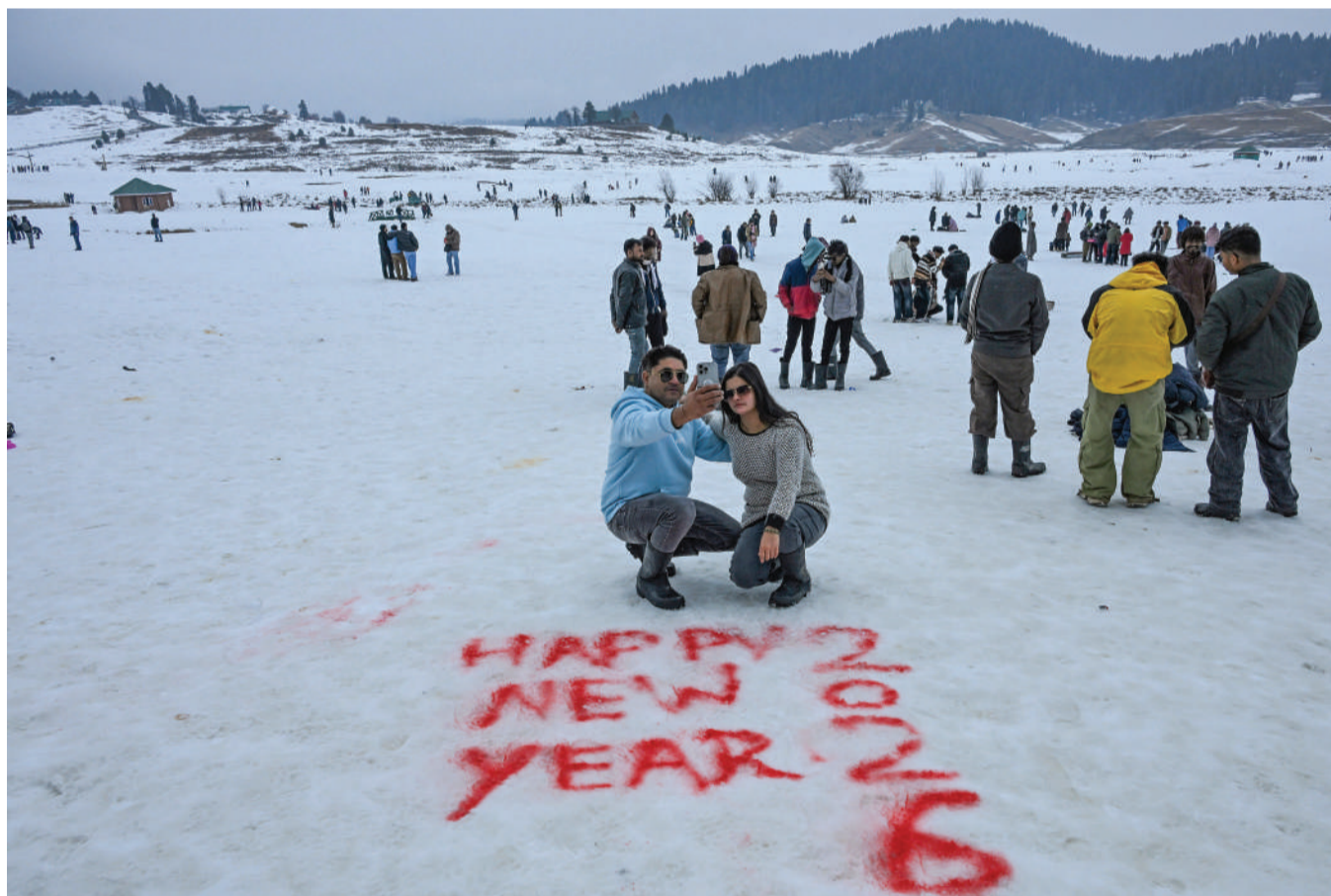
Tourists and locals ring in New Year 2026 amid snow, selfies, and celebrations on the white meadows of Gulmarg.