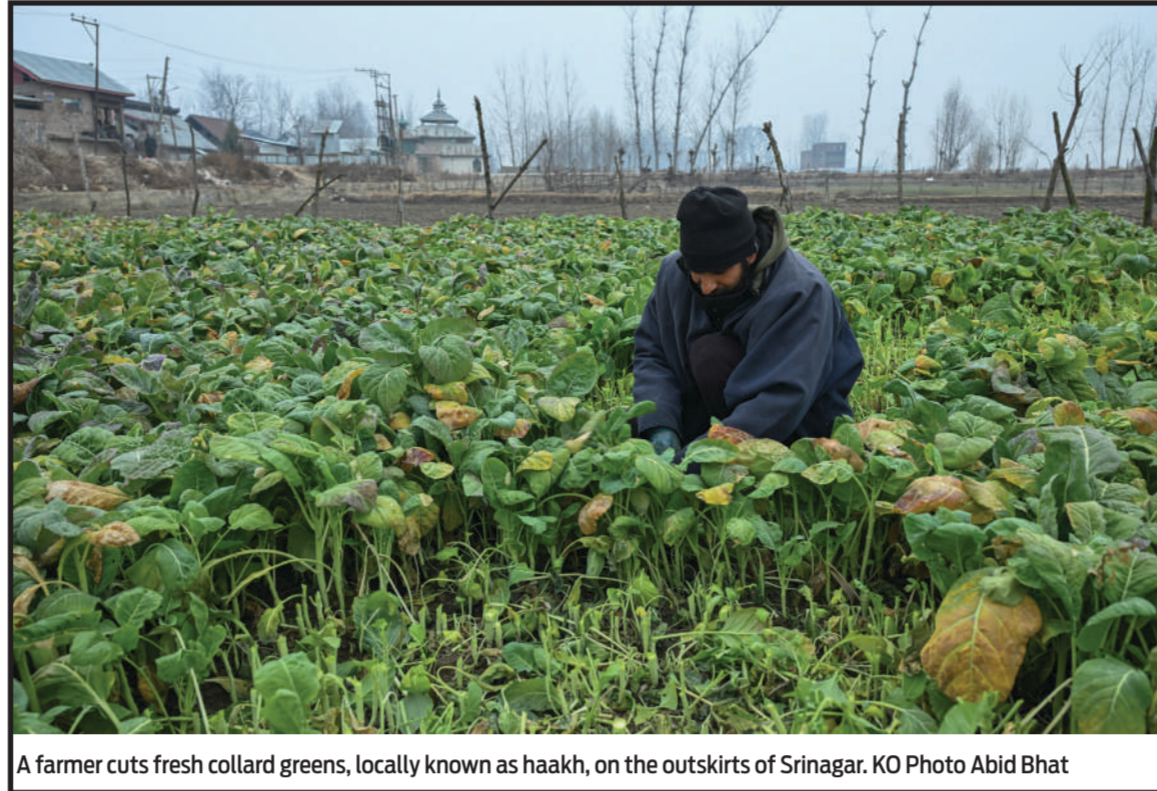
A farmer cuts fresh collard greens, locally known as haakh, on the outskirts of Srinagar.

Significant action was also taken against properties acquired through drug trafficking. Police attached nine movable properties valued at approximately Rs 0.311 crore and 29 immovable properties valued at around Rs 40.27 crore. The total market valuation of attached properties stood at Rs 40.58 crore.