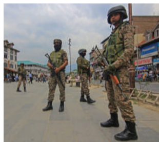
prevent any untoward incident, officials said.

Additional checkpoints have been established at important entry and exit points, while increased patrolling, area domination exercises, and surprise inspections are being carried out along vital roadways to