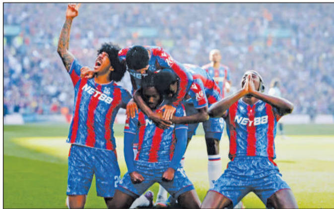
Crystal Palace's FA Cup final shock victory over Manchester City to win their first major English trophy in the modern era.