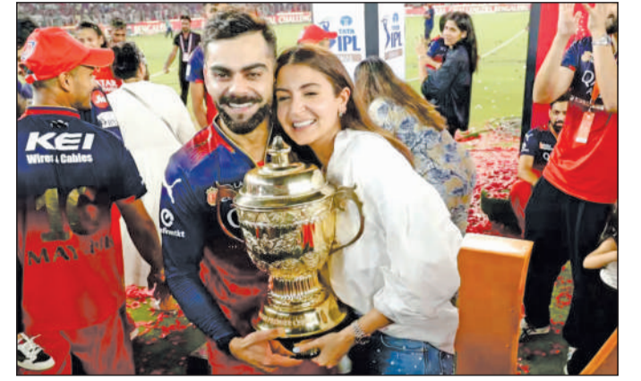
In the final against Punjab Kings, Kohli scored 43 runs off 35 balls as Bengaluru posted 190/9, eventually winning the match by six runs. The victory marked the franchise's first IPL title, ending an 18-year wait.