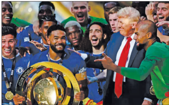
Chelsea win the expanded FIFA Club World Cup, beating PSG to become the first club to win all major UEFA trophies, a landmark moment for club football.