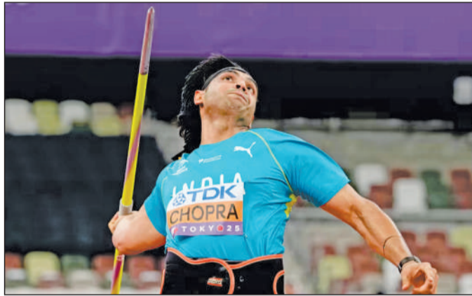
Neeraj Chopra breaking the 90m barrier in javelin, throwing 90.23m at the Doha Diamond League and setting a new Indian record.