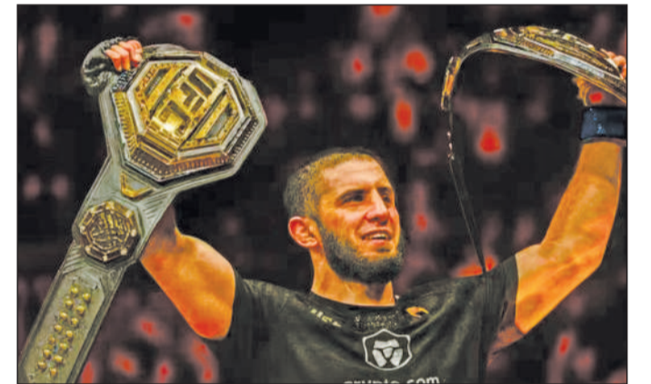
In MMA's biggest year of shifts, Islam Makhachev etched his name in history by capturing belts in both lightweight and welterweight divisions.