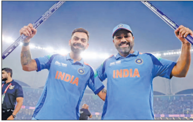
Rising above the noise, Kohli and Rohit played pivotal roles in India's triumphant Champions Trophy 2025 campaign, silencing critics and reaffirming their enduring value.