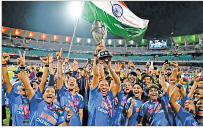
India defeated South Africa by 52 runs in the final to claim their maiden Women's Cricket World Cup title at DY Patil Stadium in Navi Mumbai.

This curated list revisits the most significant sporting moments of 2025, detailing the events, venues, champions, and defining performances that made the year unforgettable. Together, these stories capture a season of ambition, drama, and achievement—one that will be remembered as a testament to the enduring spirit of competition at the highest level.