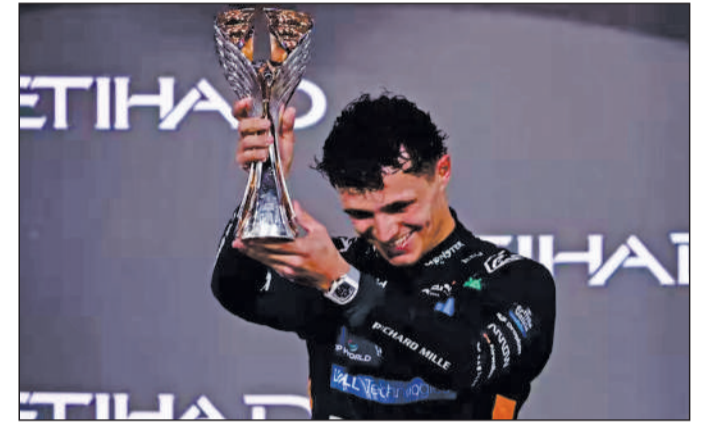
Lando Norris wins his maiden Formula 1 World Championship, becoming a defining figure in F1's 2025 season.