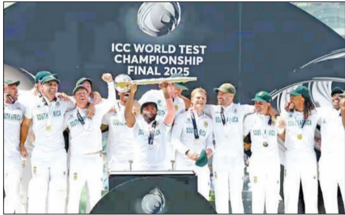
South Africa's World Test Championship win at Lord's against the mighty Australia. Proteas clinched their first major ICC title in decades with a memorable victory over Australia.