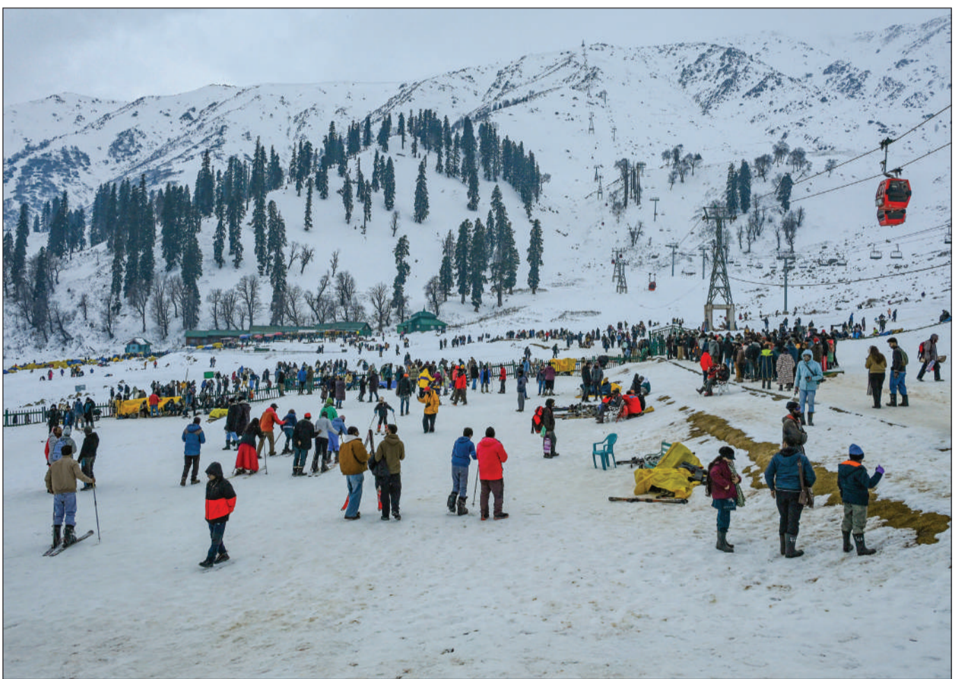
Gulmarg sees a surge of tourists as fresh snow carpets the ski resort.