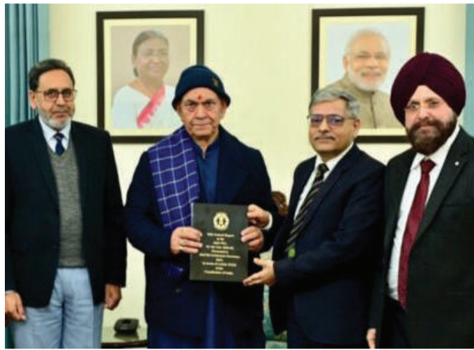
KO Web Desk

Srinagar: Jammu & Kashmir Public Service Commission (JKPSC) today submitted its 66th Annual Report for the year 2024-25 to the Lieutenant Governor, Manoj Sinha, at Lok Bhavan Jammu.