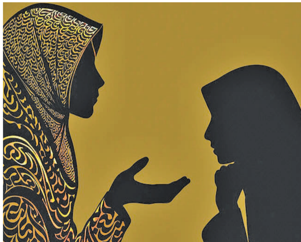
Illustration by Mehdi Saeedi

Villagers recall a time when girls stayed indoors after