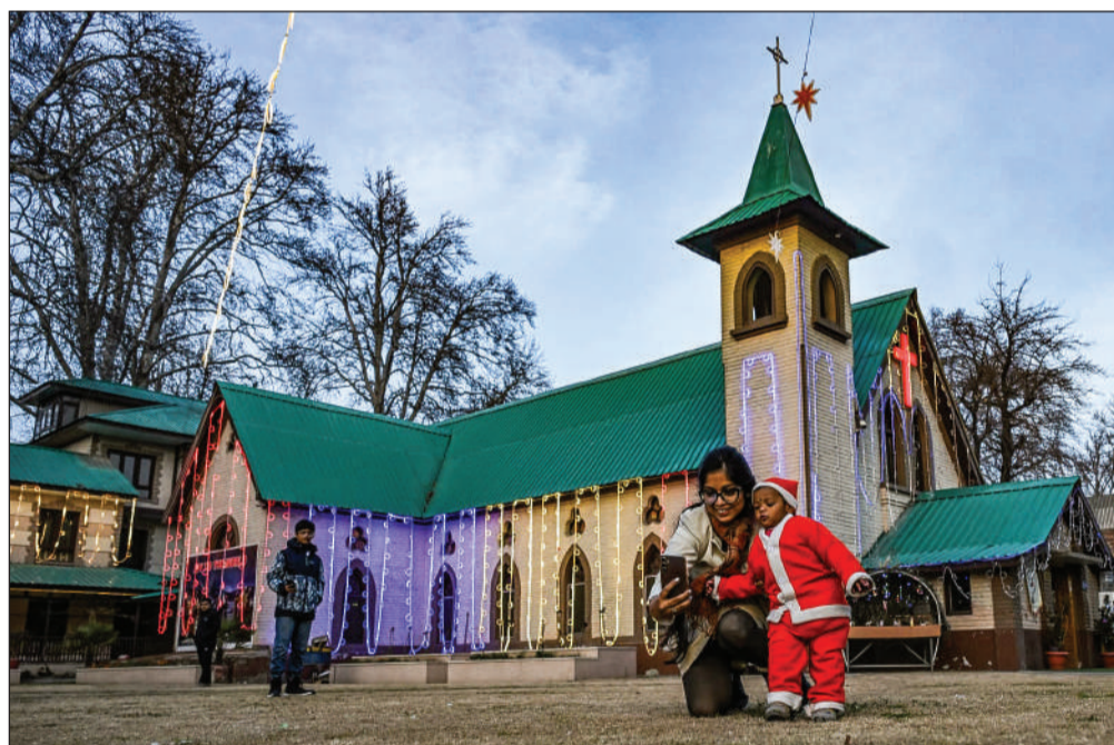
People pose for photographs outside a church illuminated for Christmas celebrations in Srinagar.