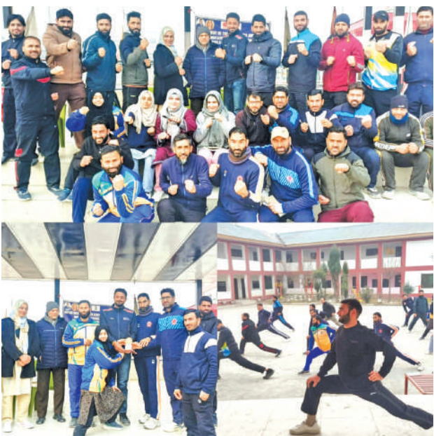
The refresher-cum-orientation training course for REKs concluded successfully at HSS Chadoora on Monday.

sey bearing No. 10, chanted his name continuously. He was then standing there waving to the stands smiling, something he tried to do in Kolkata too but could not as, unlike the Arun Jaitley Stadium, he was crowded by too many people, including politicians and their aides, at the Salt Lake Stadium on Saturday. He was seen kicking the ball at the stands along with his Inter Miami teammates Luis Suarez and Rodrigo De Paul while taking a round of the venue that registered an attendance of around 25000. Messi also felicitated the Minerva Academy football team. The script was specifically written for Messi, and, as is his wont, he played the role to perfection.