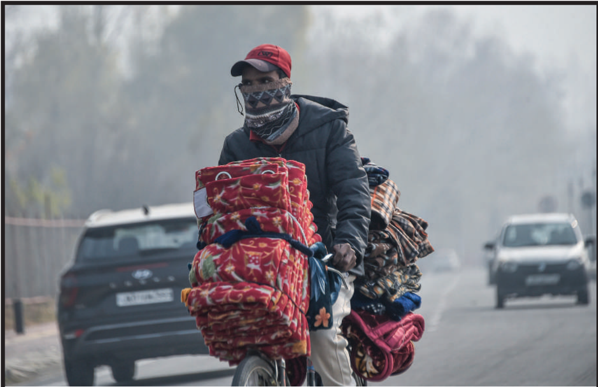
A bicycle vendor carries stacks of blankets through the chilly morning haze in Srinagar.