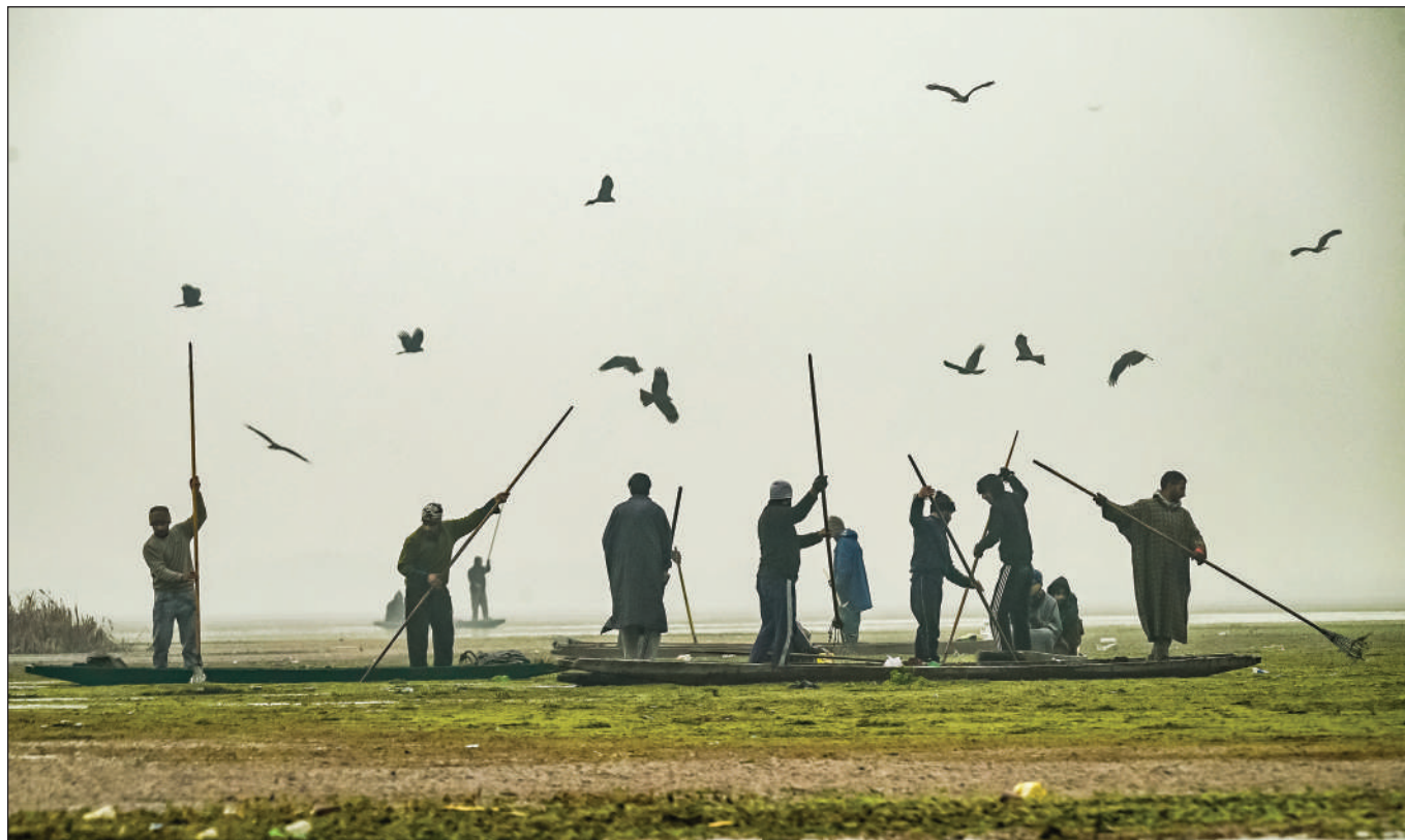
Fishermen use harpoons to catch fish in the waters of Anchar Lake, Srinagar, employing a traditional technique known as shadow fishing.

Officials said the funds are being utilised to strengthen healthcare delivery through Ayushman Arogya Mandirs, ambulance services, ASHA | More on P6