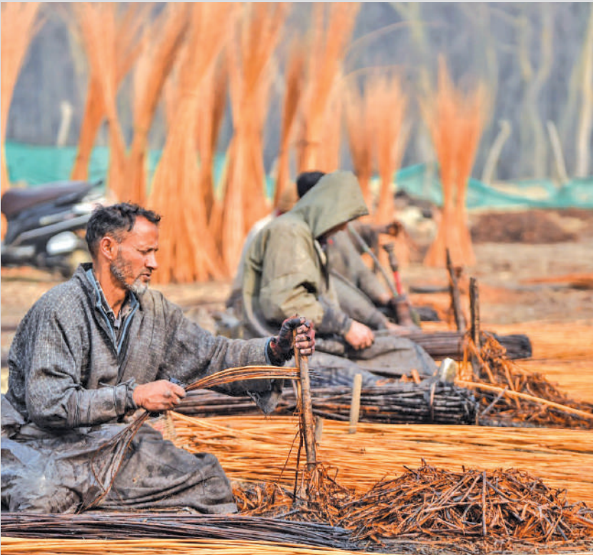
CRAFTSMEN PEEL BARK from freshly cut wicker sticks in a Ganderbal village, preparing them for Kangri making.

The awards ceremony brought together policymakers, conservationists and tourism professionals, underscoring the growing emphasis on nature-positive and community-driven tourism models.