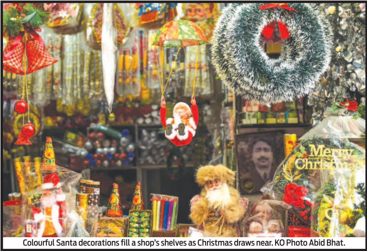
Colourful Santa decorations fill a shop's shelves as Christmas draws near.