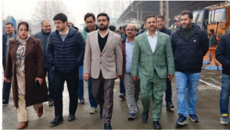
The DC and SMC Commissioner inspected the deployment of men and machinery and took stock of coordination systems established to manage snowfall and related exigencies"

At the ICCC HMT, the officers assessed the Centre's operational readiness for real-time monitoring of winter arrangements and interacted with officials from multiple departments