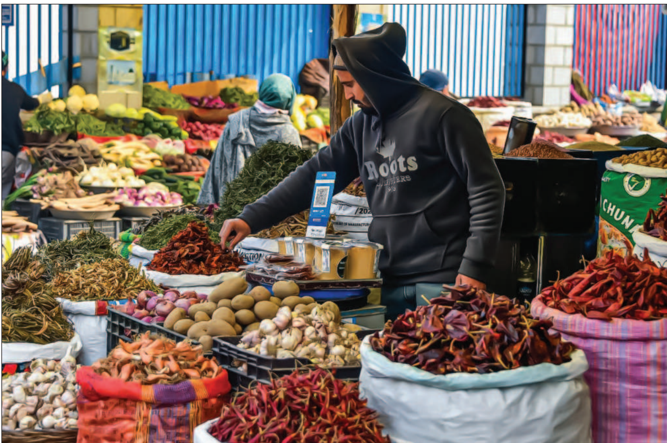
A vendor selling dried vegetables, locally known as Hokh Syeun, an essential part of Kashmir's traditional winter cuisine.

"It is the duty of everyone to become an inspiration for the youth," he said, stressing that J&K's youngsters have immense potential to | More on P6