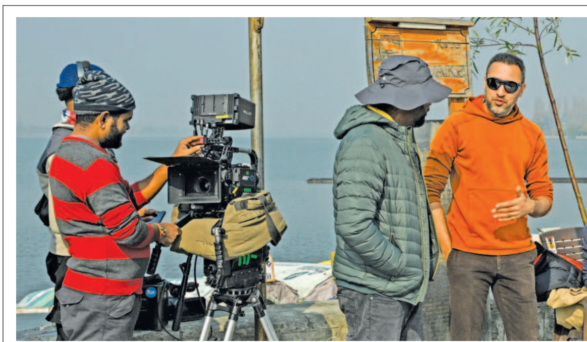
BOLLYWOOD ACTOR IMRAN KHAN shooting for a web series on Boulevard Road in Srinagar.

He further reviewed various knowledge and policy outputs being developed under CiTAG's guidance, such as the Skill Gap Study, PPP Policy Framework, Policy for Attracting Foreign Direct Investments (FDIs), Road Safety and Urban Mobility Plans, Promotion of Start-ups, and Replication of Best Practices across departments.