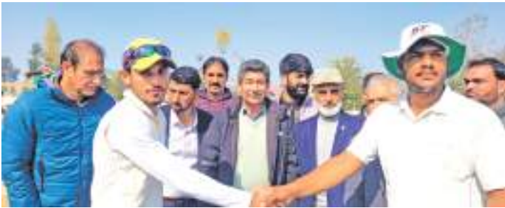
District Deputy Police Officer and the Station House Officer (SHO) of the concerned police station, who joined the gathering to encourage the participating teams and promote the spirit of sportsmanship and discipline among youth.